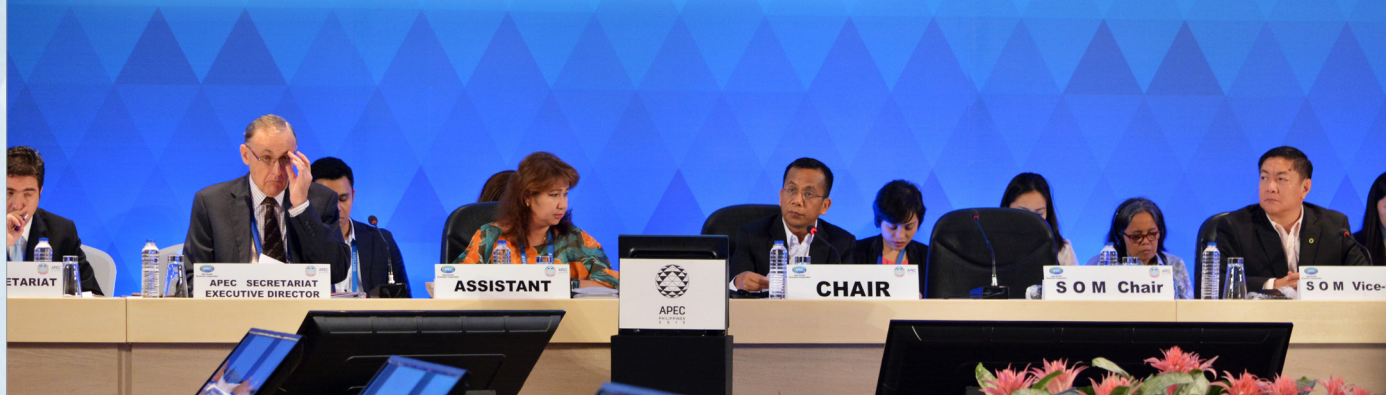
NEDA serves as chair in the 2nd APEC Structural Reforms Ministerial Meeting.

September 07 - 08, 2015 | Cebu City, Philippines