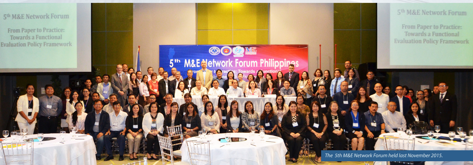
The 5th M&E Network Forum held last November 2015.

The PSRTI also conducted trainings on project impact evaluation or the Impact Evaluation of Development Projects using STATA from September 28 until October 2, 2015. It also conducted 33 training courses including one international course to provide participants with practical knowledge, skills, and experience in various aspects of statistical work. These regular and customized courses covered the areas of data collection and processing, database management, data analysis and statistical modelling, among others. Customized training courses were conducted in collaboration with different agencies, including NEDA, TESDA, PSHS, PAG-IBIG Fund, ERBSI-EWS-CAR, ARMM, UNESCAP/SIAP, among others.