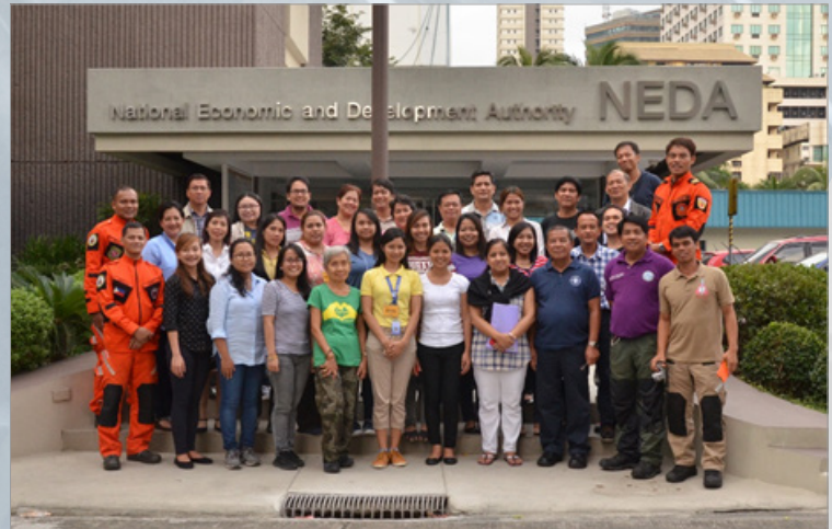
Training on Disaster Preparedness and Basic Emergency Response held last October 2015. The training was participated in by personnel from the NEDA Central Office

NEDA personnel in the central and regional offices also participated in different capability building activities on programming in STATA, leadership and management, impact evaluation, policy analysis, tariff classification, RPMES orientation, inclusive growth and regional development planning, disclosure policy and records management, coaching and mentoring, project development, Orientation Seminar on Executive Order 608, Training on Integrating GAD in Planning Project Development, Monitoring and Evaluation and Developing a Results-Based Management Framework, RA 9184 orientation, among others.