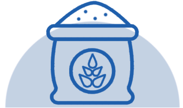
Rice tariffication law