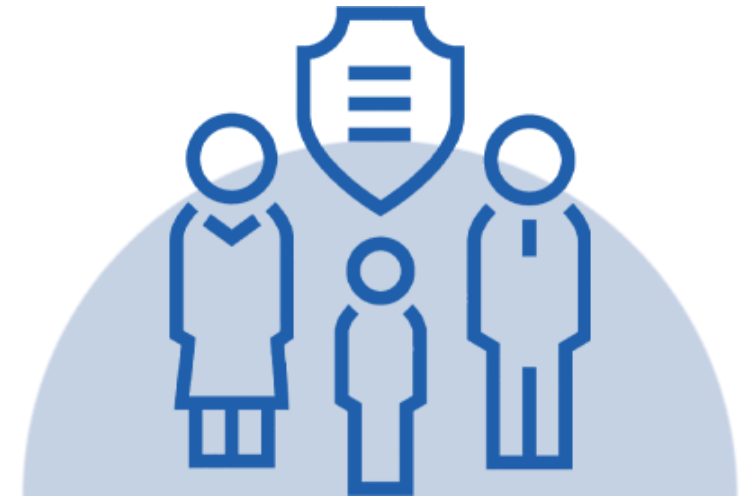
National ID Program