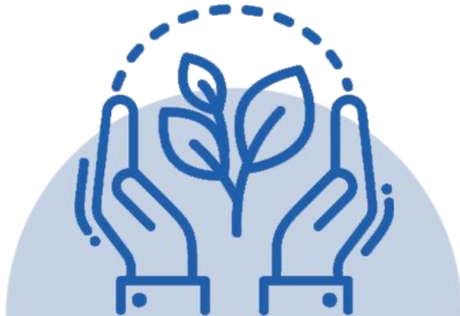
Pantawid Pamilyang Pilipino Program (4Ps)

Even when we had achieved our 2022 poverty goals by 2018, this government did not slow down on its reform agenda.