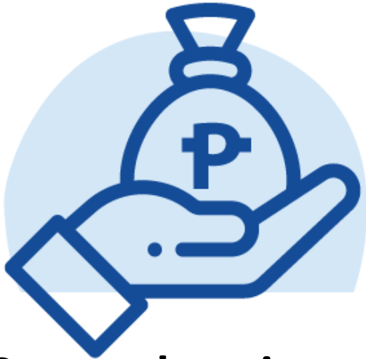
Comprehensive tax reform program

This early gain in reducing poverty was driven by prudent macroeconomic management and the enactment of a number of reforms that increased income opportunities for the people.