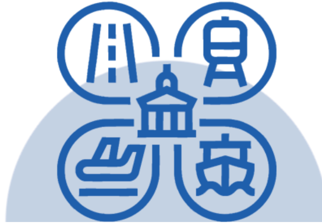
Build, build, build